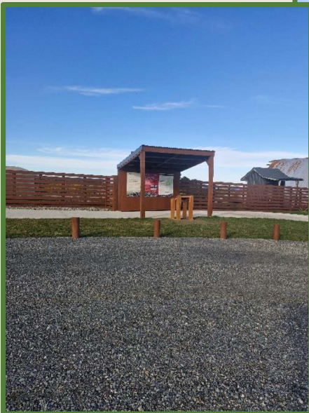
(L-R clockwise) The shelter at the carpark taking shape.

Here are some pictures of the recent and ongoing work. Watch out for more project news in next month's Western Wanderer. Ngā mihi.