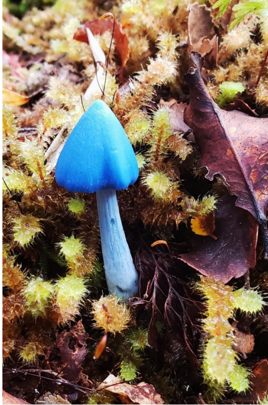
Entoloma hochstetteri (werewere-kōkako/blue pinkgill)