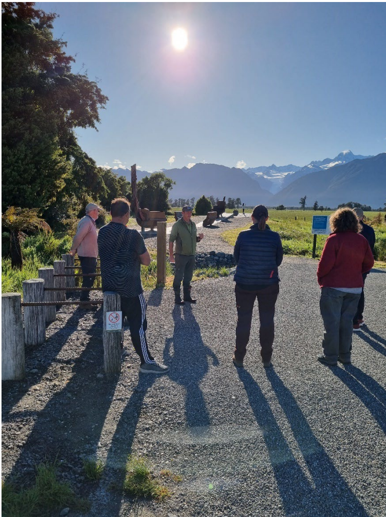
Board Members at Te Kopikopiko o te Waka

The Board had the opportunity to visit the White Heron Sanctuary and was informed about the significance of tourism in the immediate area as well as the conservation programmes to protect the birds.