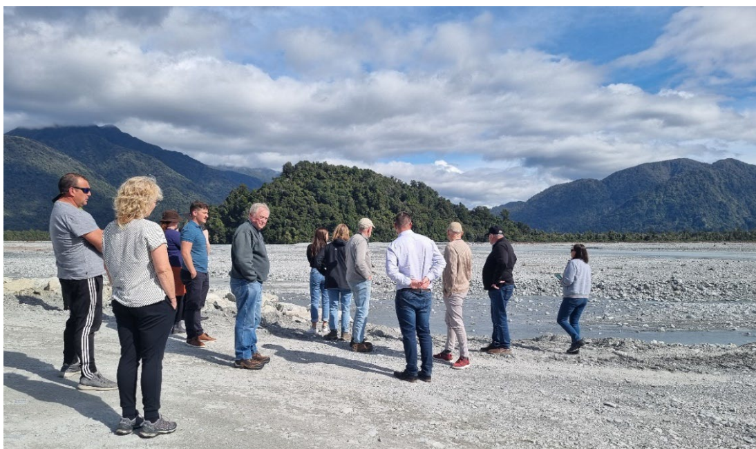
Board Members receiving a briefing from West Coast Regional Council staff at the Waiho River.

Following a lunch stop at the Franz Josef Township, a full briefing on the flooding issues and potential impacts on the Township if the Waiho river breached the Northern stop banks was provided by the West Coast Regional Council. An on-site visit to the stop banks with the engineers provided a good perspective of the risks being faced by the township should the river change course and flood. The Board eventually arrived at Te Tauraka Waka a Māuri marae and were welcomed by mana whenua Ngāti Māhaki.