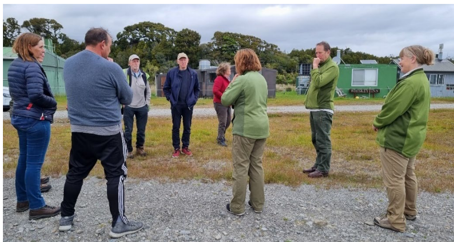
Board Members receiving a briefing from DOC Staff during a visit to the Waita River.