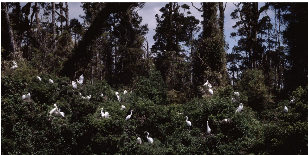
White Heron Colony