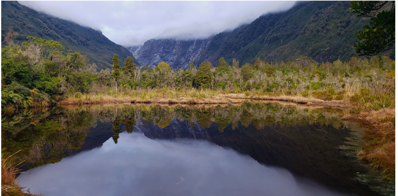
Peters Pool, Franz Josef