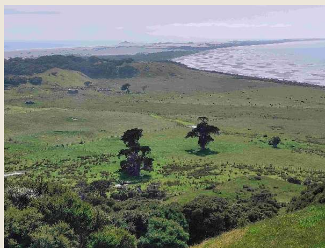
Triangle Flat, with Farewell Spit in the distance

Grazing contributes to achieving conservation objectives through managing weeds and fire risk.