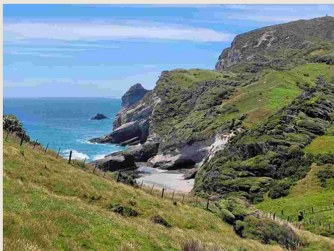
Cape Farewell coastline

Pūponga Farm Park has high cultural value to Ngāti Tama, Te Ātiawa and Ngāti Rārua.