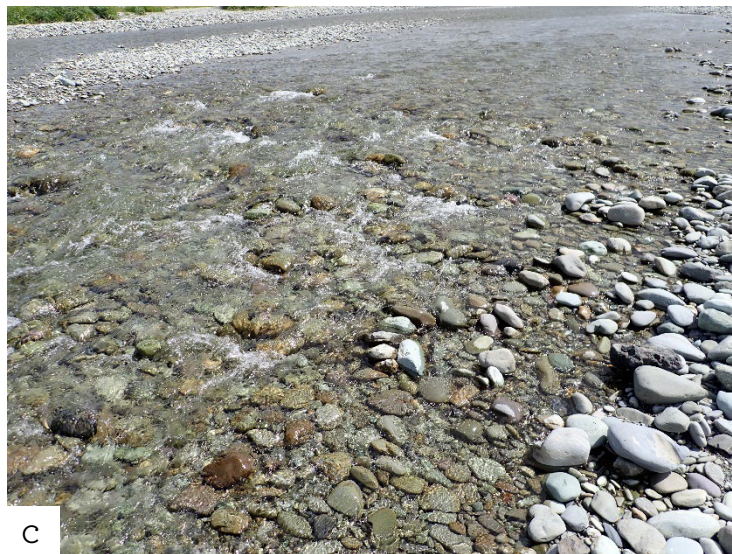
Figure 2. Galaxias affinis paucispondylus “Southland” habitat. (A) chute channels in transverse bar. (B) cobble-boulder dominated run. (C) head of steep pool-riffle sequence.