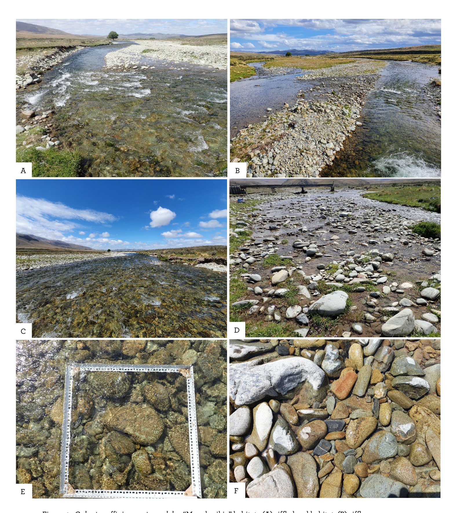
Figure 3. Galaxias affinis paucispondylus "Manuherikia" habitat. (A) riffle head habitat. (B) riffle habitat at change in gradient within diagonal bar. (C) shallow fast flow in cobble boulder substrata dominated run-riffle sequence. (D) complex side channel habitat. (E) clean cobble boulder run habitat. (F) imbricated substrata particles.