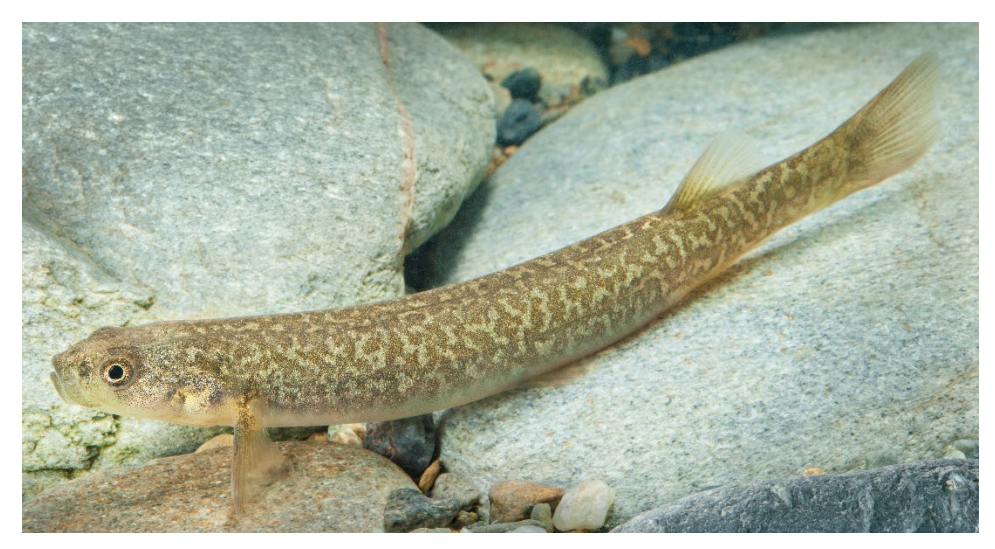
Figure 1. Galaxias affinis paucispondylus "Manuherikia" (Alpine galaxias (Manuherikia River)).

Galaxias affinis paucispondylus "Manuherikia" (Alpine galaxias (Manuherikia River)) is an iteroparous, spring spawning, non-diadromous, undescribed taxon endemic to Otago on South Island. Galaxias affinis paucispondylus "Manuherikia" is confined to the braided gravel-bed upper reaches of the Manuherikia River within the Clutha River catchment. Galaxias affinis paucispondylus "Manuherikia" has a conservation status of Threatened: Nationally Endangered (Dunn et al. 2018).