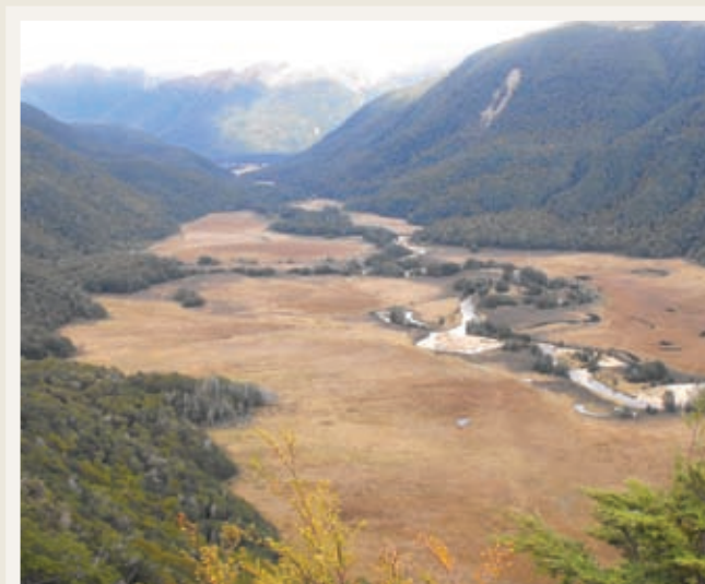
The Grebe Valley

Sign posted from Borland Road, follow the main pylon access road to the end, where the track begins. A steep climb for approximately 2 km (1 ½ hours) follows a marked route to the open tussock tops. Snow poles mark the route onto the slopes of Eldrig Peak.