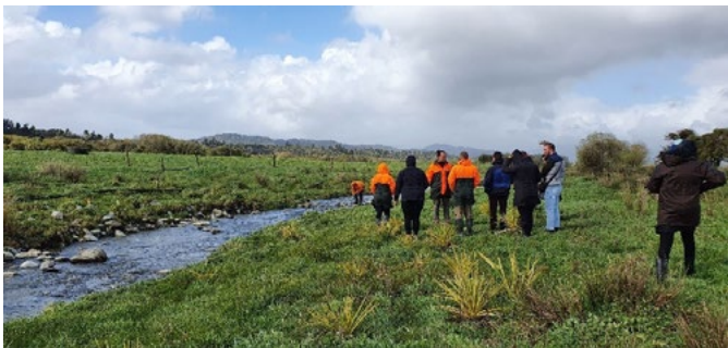
Inspecting new riparian planting in the lower Arahura River.