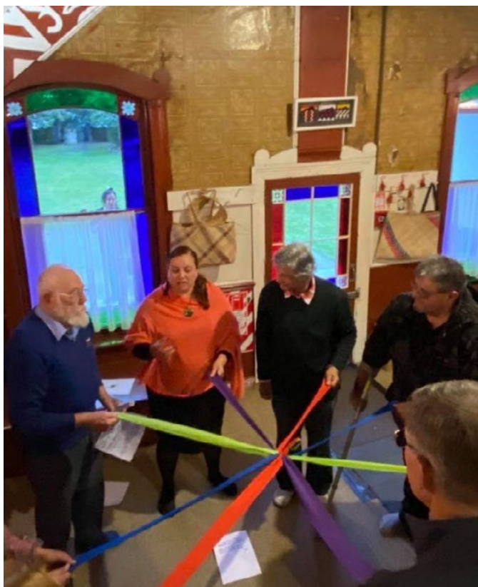
Waikanae ki Uta ki Tai Steering Committee iwi and community representatives in a workshop.