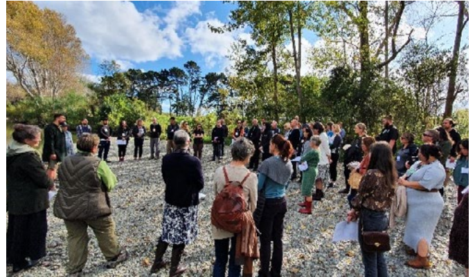
National Ngā Awa hui held in Waikanae with the DOC network and some mana whenua, reinforcing the importance of partnership, collaboration and co-design.