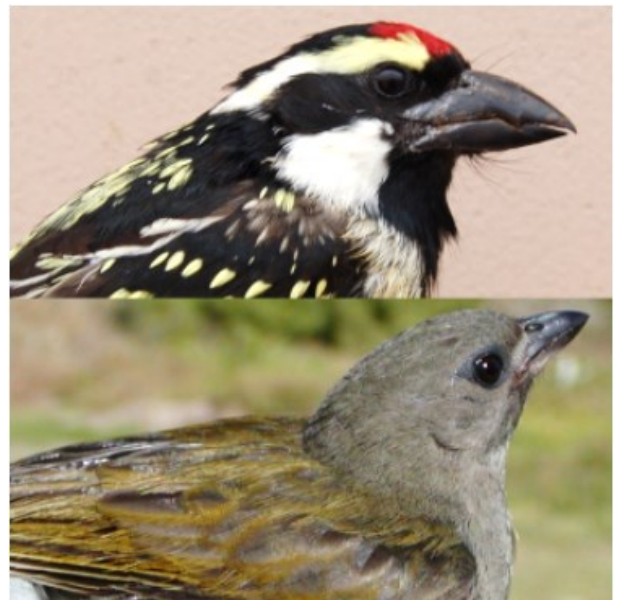
Acacia Pied Barbet and Lesser Honeyguide

Please forward to anyone you know that may be interested in going on this expedition – details are at http://thebdi.org/about/african-ringing-expeditions/ or contact dieter@thebdi.org .