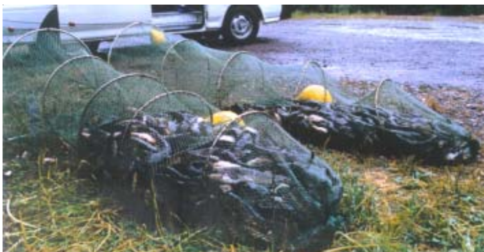
Figure 3. Two fyke nets containing 10% of the catfish caught during the study.