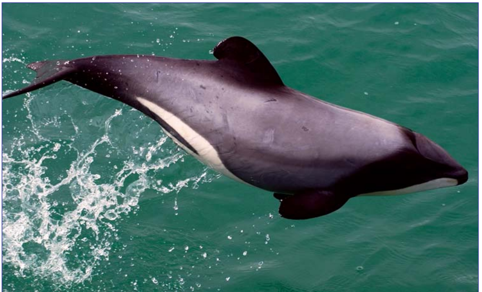
Hector's dolphin ( Cephalorhynchus hectori).

Wildlife managers or researchers who consider using a new marking method, or the application of an existing method to a new population, must first conduct an evaluation of the effects of the method itself on individual animals, the population or ecosystem. Such preliminary studies will help to determine the appropriate welfare safeguards, and give an indication of the reliability of the data obtained from that particular marked population.