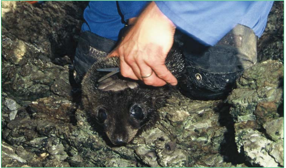
Clipping seal pup.