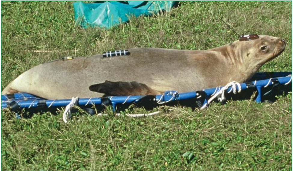
Seal with transponder (an external device, glued to the fur, which drops off when glue fails or when fur is shed as part of the normal growth cycle).